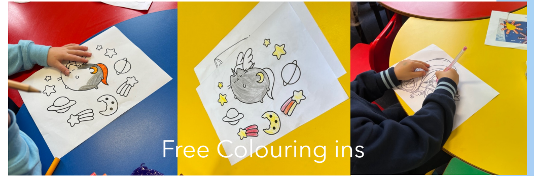
Free Colouring ins