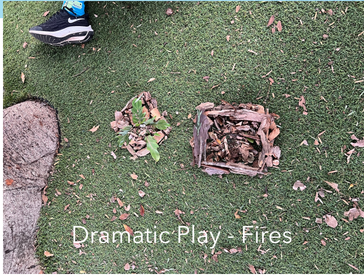
Dramatic Play - Fires