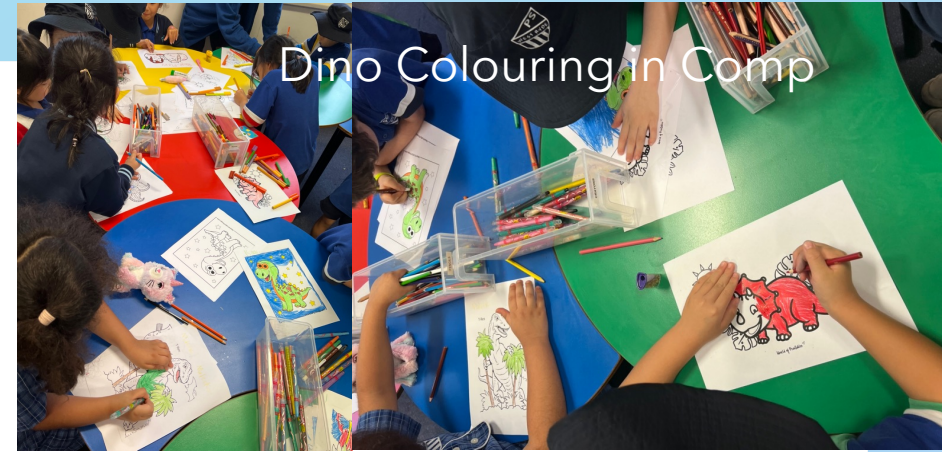
Dino Colouring in Comp