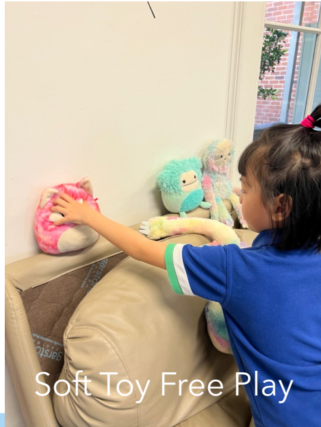
Soft Toy Free Play