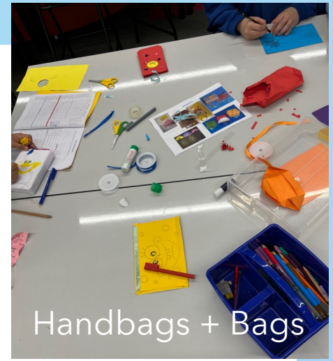
Handbags + Bags