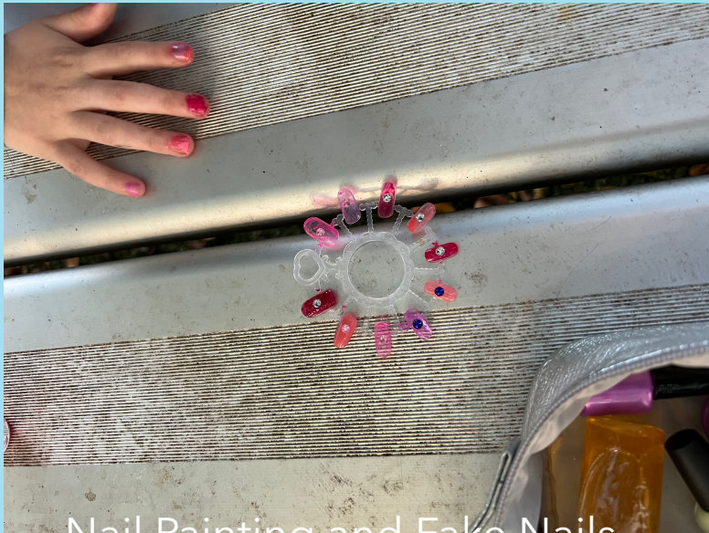
Nail Painting and Fake Nails