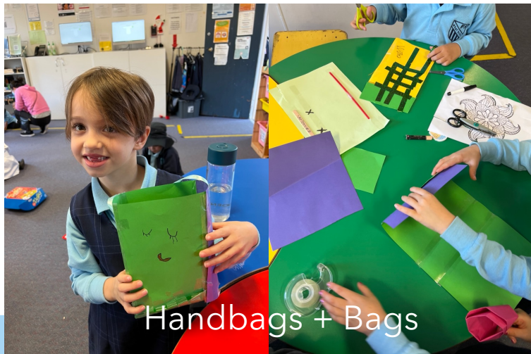
Handbags + Bags