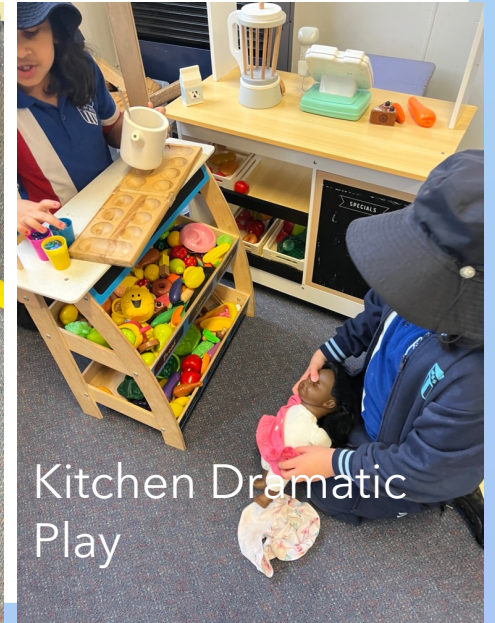
Kitchen Dramatic Play