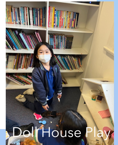
Doll House Play